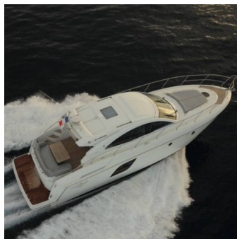
Flyer Gran Turismo 49